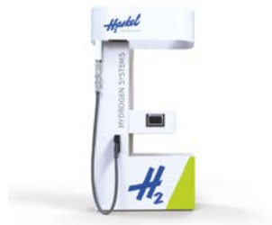
Hydrogen 'E' Dispenser