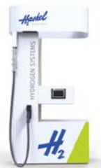
Hydrogen 'E' Dispenser