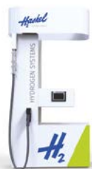
Hydrogen 'E' Dispenser