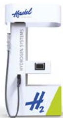
Hydrogen 'E' Dispenser